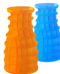
8348952 & 9247971