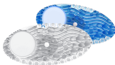
5907942 & 3720707