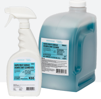
EPA Reg. No. 1677-272 and 1677-273 (RTU)